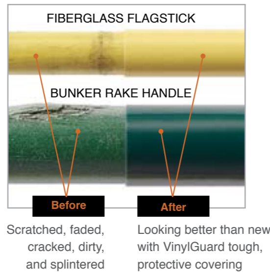
Scratched, faded, cracked, dirty, and splintered Looking better than new with VinylGuard tough, protective covering